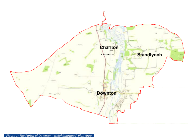
Figure 1: The Parish of Downton - Neighbourhood Plan Area