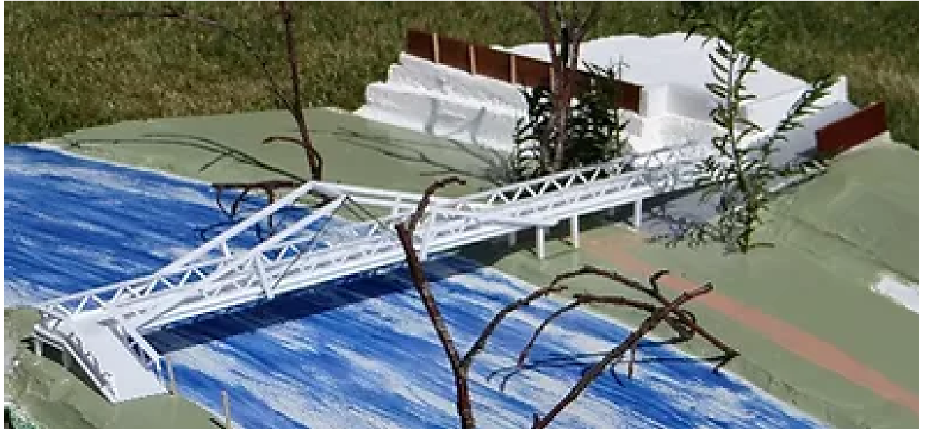
A model of the proposed bridge

In 2016, the parish council consulted all residents on the East side of the river and residents in South Lane on the West side - but further consultation will be required if planning permission is granted. The County Council's planning department will take responsibility for notifying residents who will be most affected about the detailed plans. The Radnor Estate gave their permission for a 'permissive path' (on a minimal lease) in April 2017.